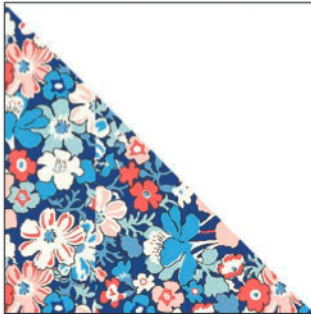
HALF SQUARE TRIANGLE

(8 Half Square Triangles will not be used.)